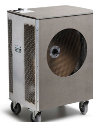
CellFlow Ind2500 Mobile SC floor standing (also available as CellFlow Ind5000 Mobile SC)