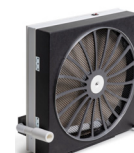
CellFlow Ind1000 SCS floor standing or ceiling mounted – also available in smaller sizes